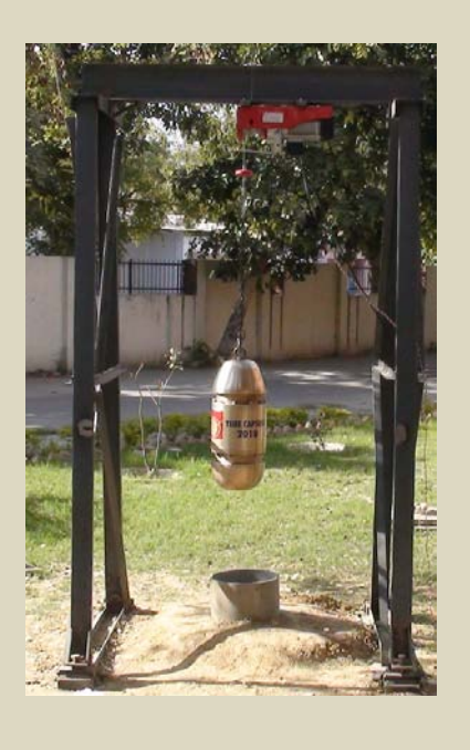
Photograph of the crane that will lower the time capsule

The marble rock placed alongside the site of the time capsule symbolizes solidity, integrity and permanence – attributes we identify with in our Institute.