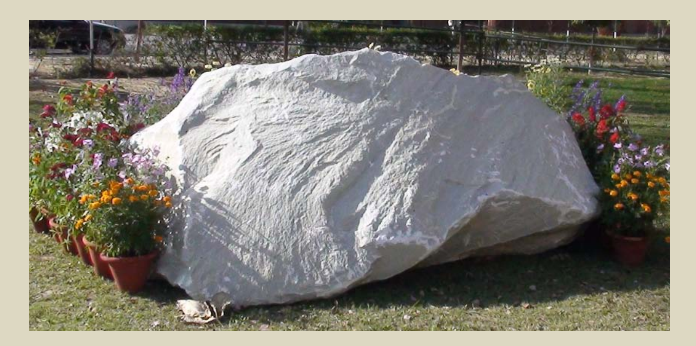
Marble rock transported from Banswada, Rajasthan

The marble rock placed alongside the site of the time capsule symbolizes solidity, integrity and permanence – attributes we identify with in our Institute.